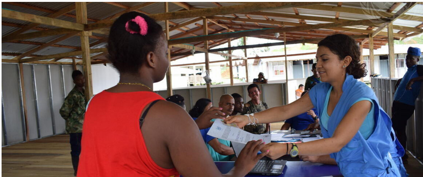
As part of the process of their reintegration into civilian life, members of the Revolutionary Armed Forces of Colombia (FARC-EP) receive certificates for laying down their individual weapons from the UN Mission in Colombia and accreditation from the Office of the country's High Commissioner for Peace.